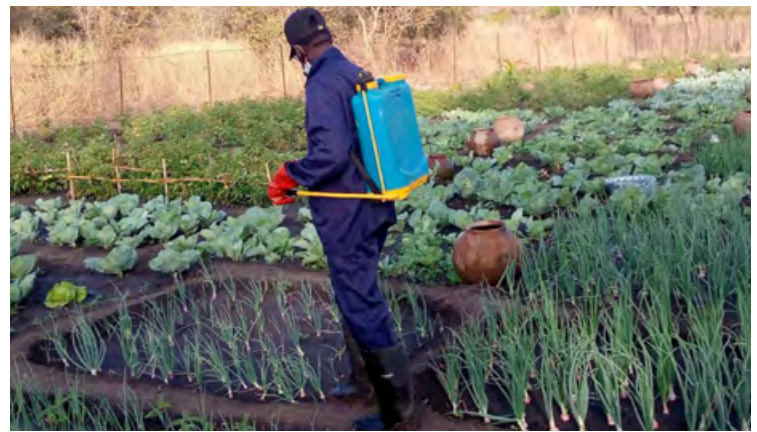
"Adopt a Vegetable Garden" project in the Bassari region, Senegal

We began our collaboration with the project "Apadrina una Huerta" ("Adopt a vegetable garden") , which aims to provide water infrastructure to communities in eastern Senegal, in the Bassari region , to improve, in an organised way, production of horticultural products for self-consumption and local marketing. This is an innovative venture in the area, intended to generate employment and enhance the population's quality of life. It is promoted and implemented by the Yakaar Africa organisation based in Senegal and Spain.