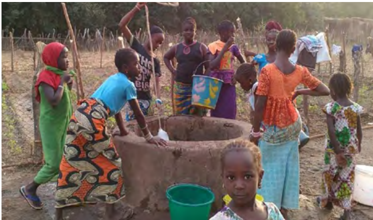
"Adopt a Vegetable Garden" project in the Bassari region, Senegal

We also participated in the new project "Futuro Vivo" ("Alive Future") , in which we have carried out the design of a secondary school in the municipality of San Antonio de Guerra , in the Dominican Republic. With an innovative design, the development includes three single-story buildings (two classroom buildings and an administrative centre), an access road, a car park and a sports area. The action is promoted by the congregation of the Carmelite Sisters of Education who have a great implementation in education in the area and who will be responsible for mobilising funds for the construction of the school. The design was done by MEXTYPSA and was delivered at the end of June.