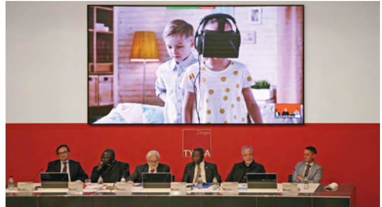
Presentation of the "Reactive" project at the Foundation meeting