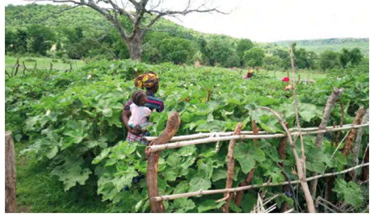
"Adopt a Vegetable Garden" project in the Bassari region, Senegal

We began our collaboration with the project "Apadrina una Huerta" ("Adopt a vegetable garden") , which aims to provide water infrastructure to communities in eastern Senegal, in the Bassari region , to improve, in an organised way, production of horticultural products for self-consumption and local marketing. This is an innovative venture in the area, intended to generate employment and enhance the population's quality of life. It is promoted and implemented by the Yakaar Africa organisation based in Senegal and Spain.