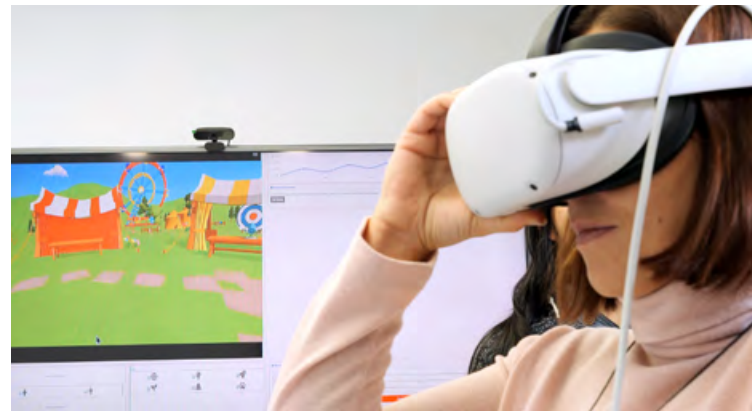
"Reactive" project. Virtual Reality for children in the Intensive Care Unit (ICU)