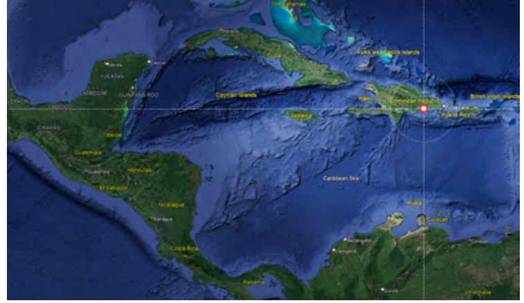
Location map of the "Alive Future" project, Dominican Republic