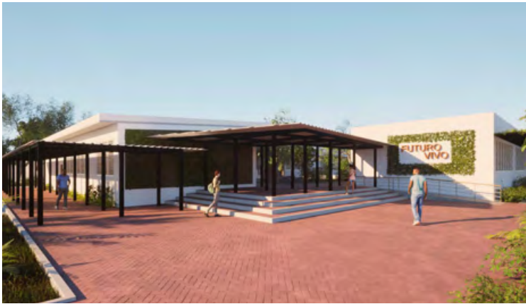
Infographics of the "Alive Future" project in San Antonio de Guerra, Dominican Republic

We also participated in the new project "Futuro Vivo" ("Alive Future") , in which we have carried out the design of a secondary school in the municipality of San Antonio de Guerra , in the Dominican Republic. With an innovative design, the development includes three single-story buildings (two classroom buildings and an administrative centre), an access road, a car park and a sports area. The action is promoted by the congregation of the Carmelite Sisters of Education who have a great implementation in education in the area and who will be responsible for mobilising funds for the construction of the school. The design was done by MEXTYPSA and was delivered at the end of June.