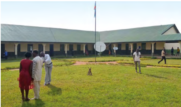
Lago Alberto University (UNILAC). Mahagi, D. R. of Congo

year the necessary funds will be provided for the construction of the university administrative building that will allow the separation of the management and administrative activities from the classroom building. In the academic aspects, the Foundation continues to count on the collaboration of the Polytechnic University of Madrid whose professors intend to make two visits to Mahagi this year, to evaluate the level of education being delivered and to organize stays in Madrid for UNILAC students and professors.