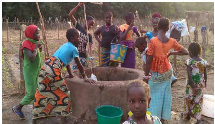
"Adopt a Vegetable Garden" project in the Bassari region, Senegal