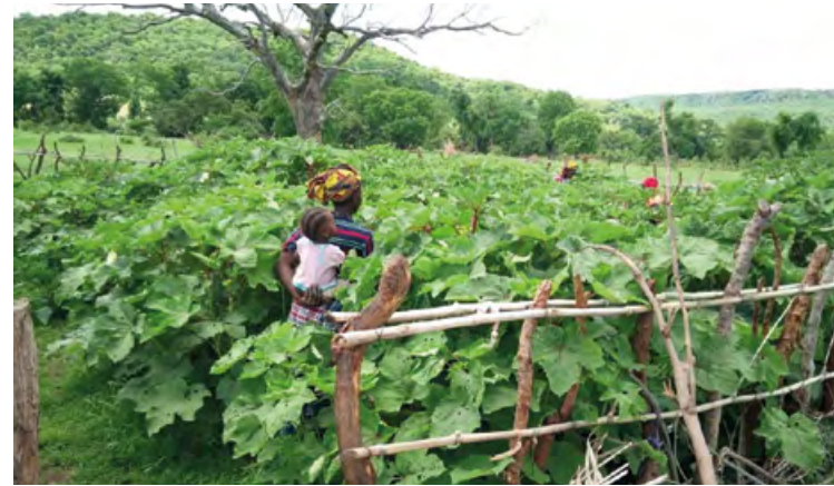
"Adopt a Vegetable Garden" project in the Bassari region, Senegal

We began our collaboration with the project "Apadrina una Huerta" ("Adopt a vegetable garden"), which aims to provide water infrastructure to communities in eastern Senegal, in the Bassari region, to improve, in an organised way, production of horticultural products for self-consumption and local marketing. This is an innovative venture in the area, intended to generate employment and enhance the population's quality of life. It is promoted and implemented by the Yakaar Africa organisation based in Senegal and Spain.