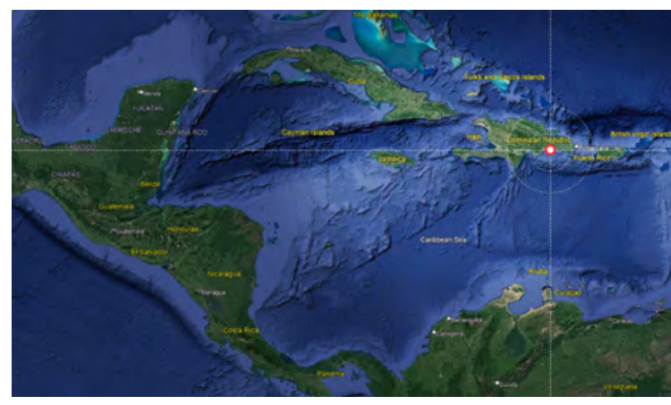
Location map of the "Alive Future" project, Dominican Republic

We also participated in the new project "Futuro Vivo" ("Alive Future"), in which we have carried out the design of a secondary school in the municipality of San Antonio de Guerra , in the Dominican Republic . With an innovative design, the development includes three single-story buildings (two classroom buildings and an administrative centre), an access road, a car park and a sports area. The action is promoted by the congregation of the Carmelite Sisters of Education who have a great implementation in education in the area and who will be responsible for mobilising funds for the construction of the school. The design was done by MEXTYPSA and was delivered at the end of June.